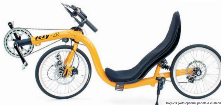
Toxy-ZR (with optional pedals & cushion)