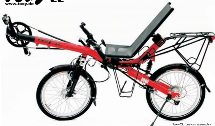
Toxy-CL (custom assembly)

Our fully suspended Toxy recumbents are the most sought after bicycles on the market due to one of a kind construction and their super handling.